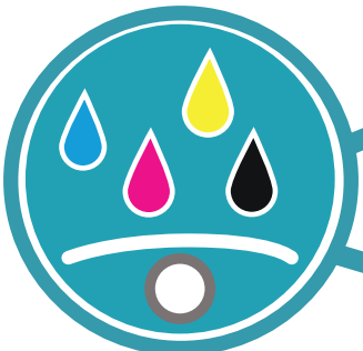
Inks / Sealants